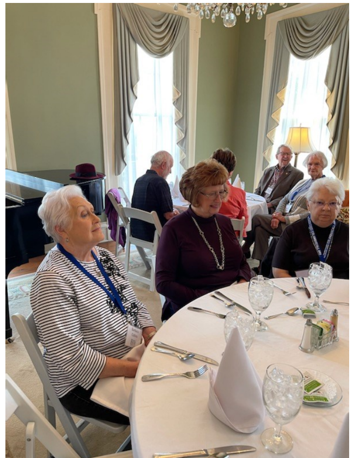
Pictures of our Columbus bus tour and lunch at the Wynn House On April 14th.