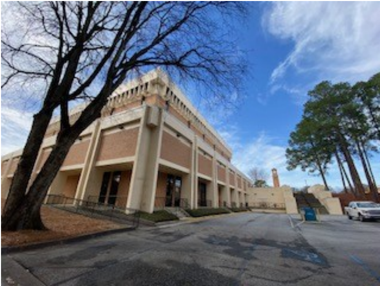
The archives are located in the building pictured.